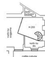
Piano TERRA/ Soppalco