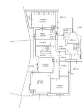
PIANO PRIMO SOTTOTERRADA